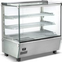
EFH 120 Heated Displays

W: 1220 / 1525 D: 568 / 588mm Height: 686 mm Capacity: 200 / 268lt.(Gross) Temperature: 0°C - +12°C