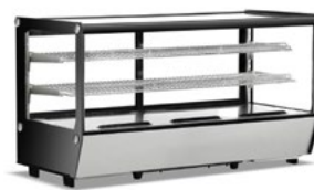
EFC 200/250 Cold Displays

Width: 880 mm Depth: 568 mm Height: 686 mm Capacity: 160 lt. (Gross) Temperature: 0°C - +12°C