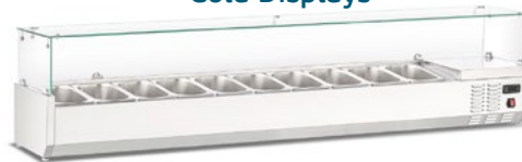
EFS 2000 Cold Displays

Width: 1800mm Depth: 335 mm Height: 447 mm Capacity: (GN PAN): 9*1/4 GN Pan Temperature: +2°C - +12°C