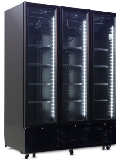
CB1600 HD WOC