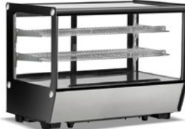
EFC 160 Cold Displays

Width: 702 mm Depth: 568 mm Height: 686 mm Capacity: 120 lt. (Gross) Temperature: 0°C - +12°C