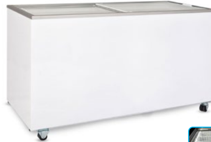
CL600 2.0m +

Width: 2050 mm Depth: 630 mm Height: 830mm Capacity: 672 lt. (Gross) Temperature: ≤-18°C