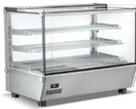
EFH 160 Heated Displays

Width: 678 mm Depth: 568 mm Height: 686 mm Capacity: 120 lt. (Gross) Temperature: +30°C - +90°C