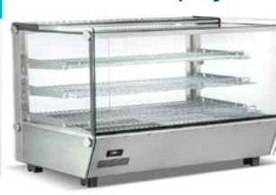
EFH 200 Heated Displays

Width: 856 mm Depth: 568 mm Height: 686 mm Capacity: 160 lt. (Gross) Temperature: +30°C - +90°C