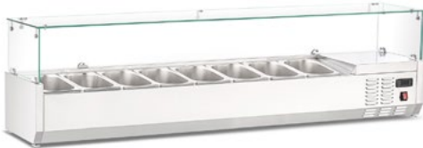
EFS 1800 Cold Displays

Width: 1198mm Depth: 570 mm Height: 690 mm Capacity: 200 lt. (Gross) Temperature: +30°C - +90°C