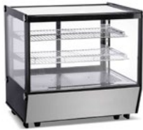
EFC 120 Cold Displays